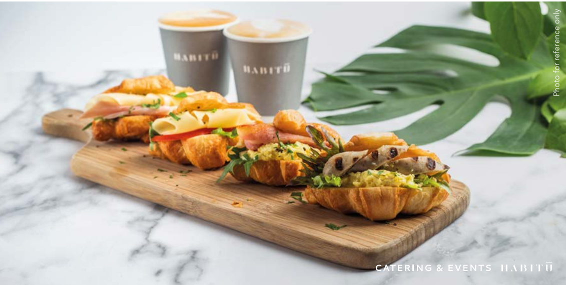
Photo for reference only